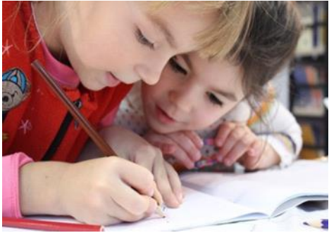
Improving Educational Outcomes