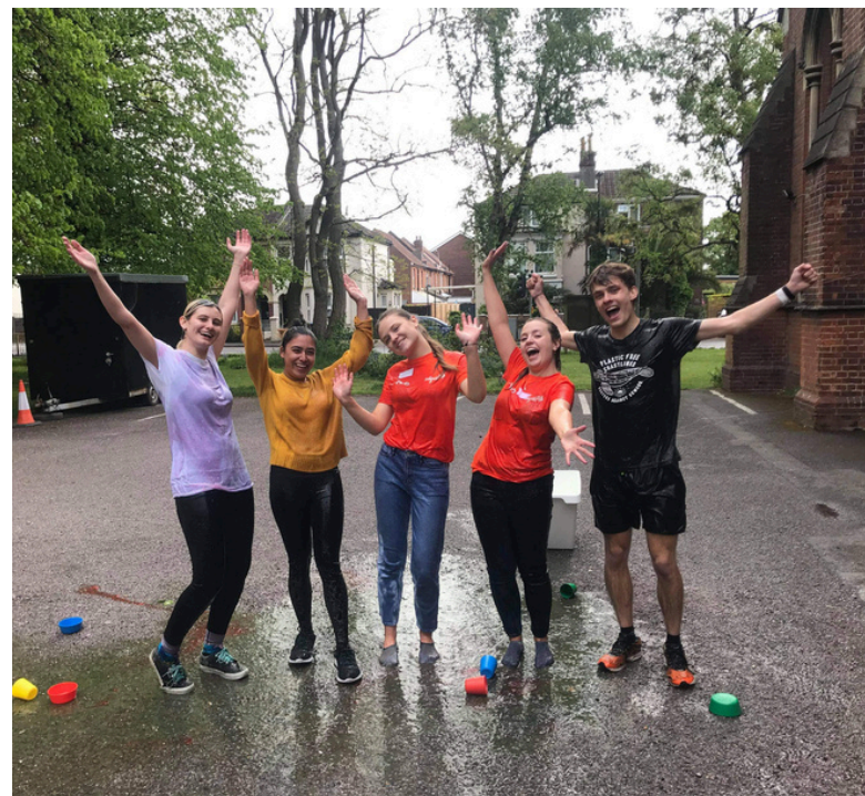
Our Southampton Hub committee's 'Gungeraiser' fundraiser

“I think I developed many skills along the way, but if I were to highlight just one, it would be what I call situational leadership. How I tailor my approach to suit the different team members and stakeholders in the project. I think this will help me very much in the future. It is inevitable no matter what you do you'll end up working with a diverse selection of people and the better you can understand each other, the better the outcome of any project will be.”